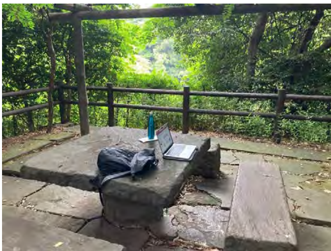
At the Hongo Campus of Tokyo University

Before leaving Japan for Germany from Haneda airport in September, I met one of my former master students in Tokyo. He now works at the Deloitte Japanese headquarter, is married with two young children. For some years to come, they plan to stay in the country. Since they found Tokyo a bit crowded, they moved to Yokohama, where the kids go to the German school, which was founded already in 1904, and now has about 600 pupils who are looking towards a bright future.